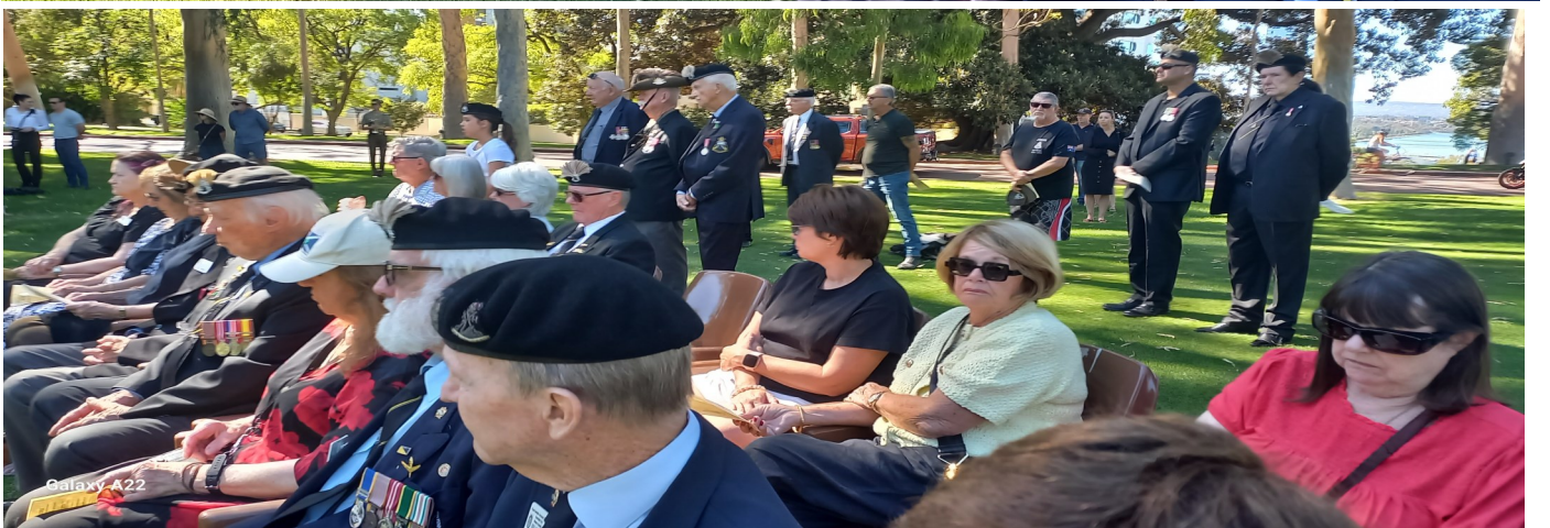
PHOTOGRAPHS FROM OLD BOYS PARADE AND ANNUAL GENERAL MEETING (Reports in previous edition 2 of Commentary)