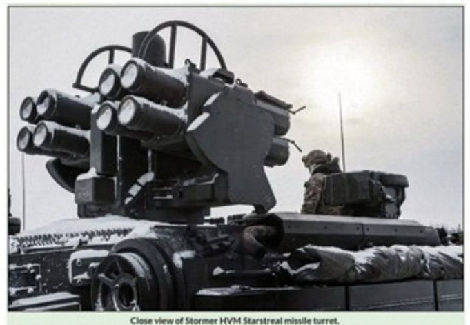
Close view of Stormer HVM Starstreak missile turret.