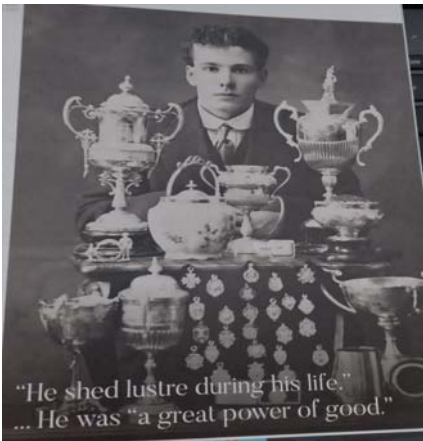
"He shed lustre during his life." ... He was "a great power of good."