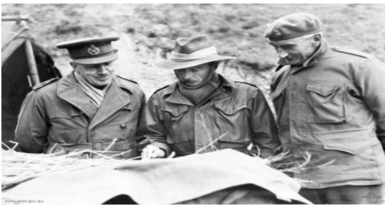
Gallipoli Campaign; Sinai and Palestinian Campaign; Western Desert Campaign; New Guinea Campaign; New Britain Campaign Occupation of Japan Korean War