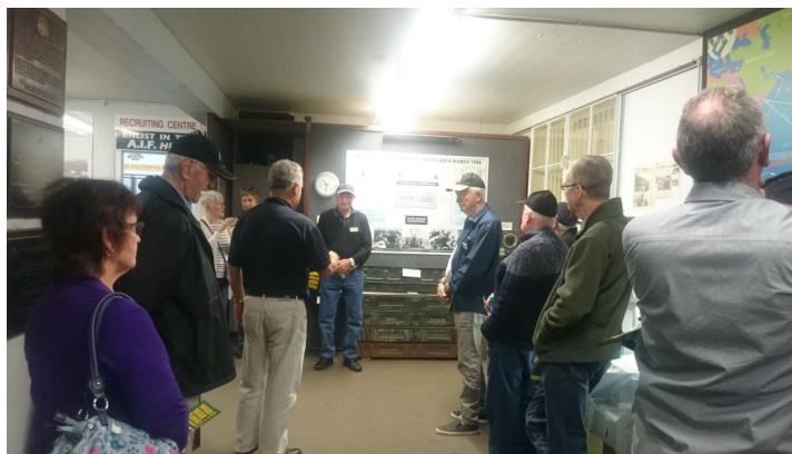
A GUIDE GIVING HIS SPEIL TO THE GROUP