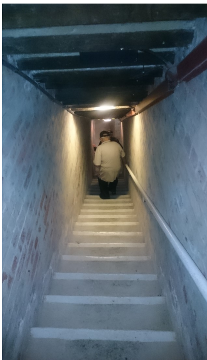
GOING DOWN INTO THE BATTERY