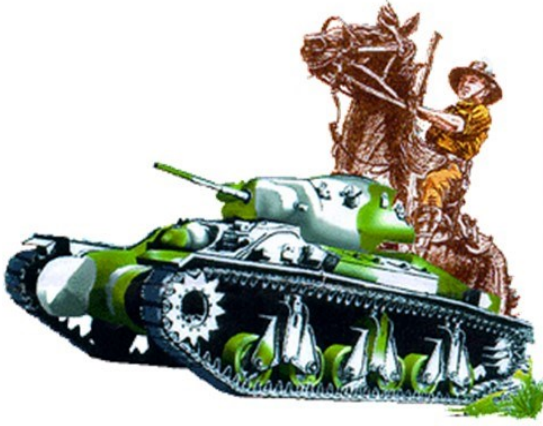
ADF CAVALRY AND ARMOUR RAAC